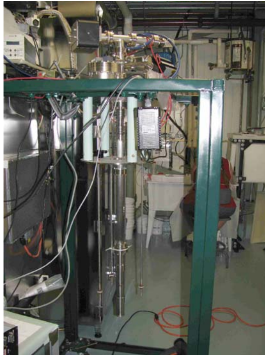
Fig. 3. Transition joint test assembly, prior to installation into the A0 Vertical Test Dewar (VTD)

Two different test beds are available to cool a SS-to-Ti transition joints assembly to superfluid temperatures: the A0 Vertical Test Dewar (A0 VTD) and the Meson Detector Building Horizontal Test System (HTS) [9, 10]. The general test plan is to confirm that at room temperature the assembly is initially leak free, then continuously monitor leak-rate during cooldown and superfluid operation.