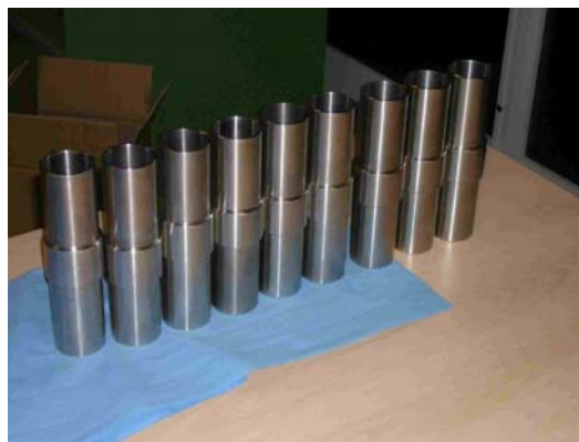
Fig. 1. SS-to-Ti transition joint tubes

Stainless steel-to-titanium bimetallic transitions have been fabricated with an explosively bonded joint, with a stainless steel sleeve covering the junction (see Fig. 1). This novel joining technique was conducted by the Russian Federal Nuclear Center (Sarov) working under contract for the transition piece fabricators at Joint Institute for Nuclear Research (Dubna, Russia). The design, fabrication, and characteristics of these bimetallic transitions are discussed elsewhere [3–6]. See Table 1 for description and geometry. All tubes were made with the same explosion-bonded joining procedure, with a stainless steel collar explosion bonded onto the external surface of the 316L SS and Ti Grade 2 tubes.