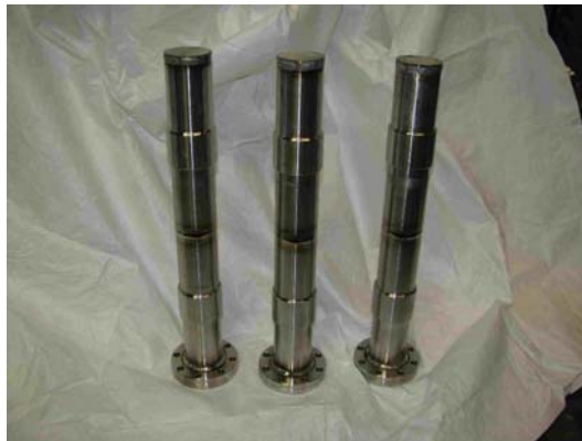
Fig. 2. The transition joint test assemblies, 47 mm OD version. Each has a pair of transition joints

The final assembly of test articles was completed at Fermilab. Five bimetallic transition joint test assemblies were made for attachment to the cryogenic test system, each with a pair of transition tubes (See Fig. 2). Also noted in Table 1, two versions of this size transition joint are available: non-annealed (N) or annealed (A) (after the explosion-bonding procedure).